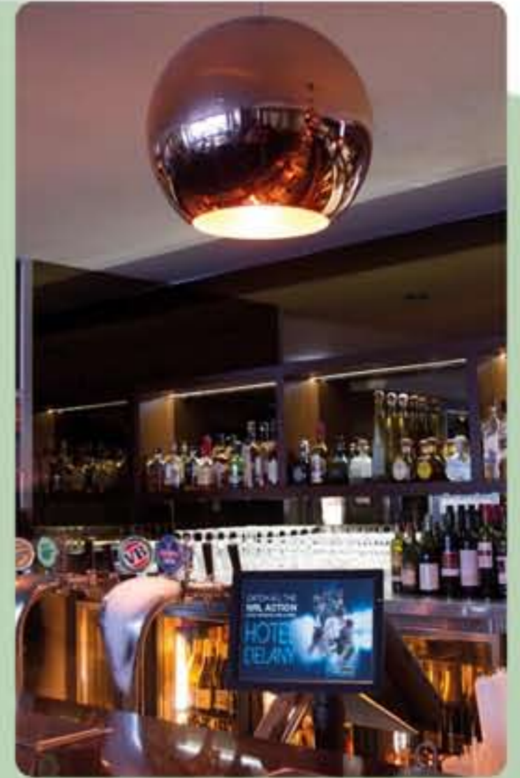
Hotel Delany, Newcastle

Targeted Marketing campaigns - target specific groups of members and create specific promotions based on previous spending habits. For example target only wine drinkers for wine tasting promotions.