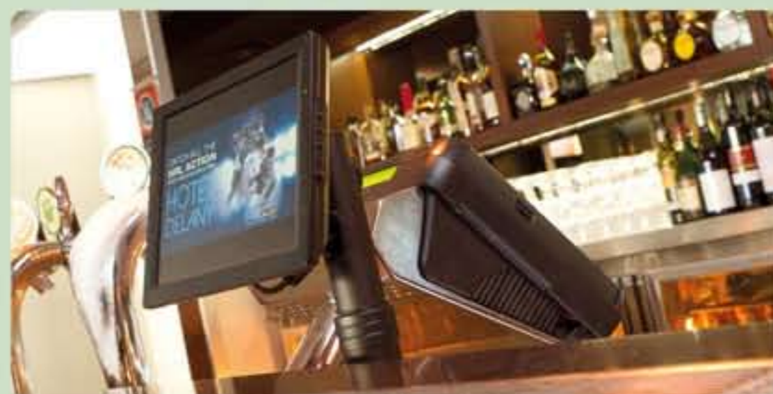
Hotel Delany, Newcastle