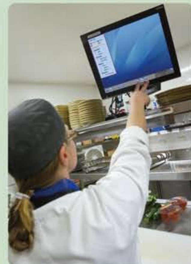
Wests, New Lambton