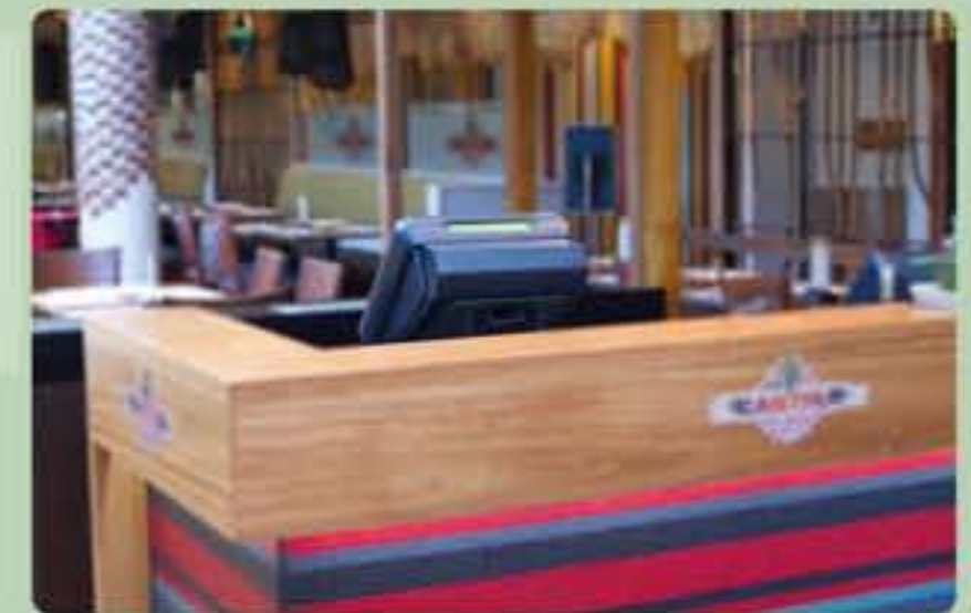
Wests, New Lambton

Patrons have the ability to purchase giftcards for your facility either through use of accumulated points or payment. The giftcards can be used at any bar or restaurant throughout your facility at any SENPOS terminal.