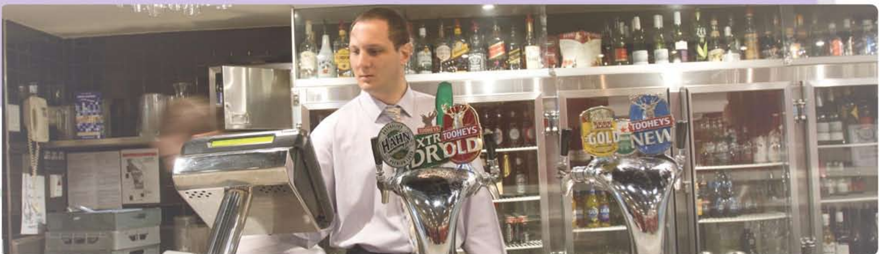
West's, New Lambton